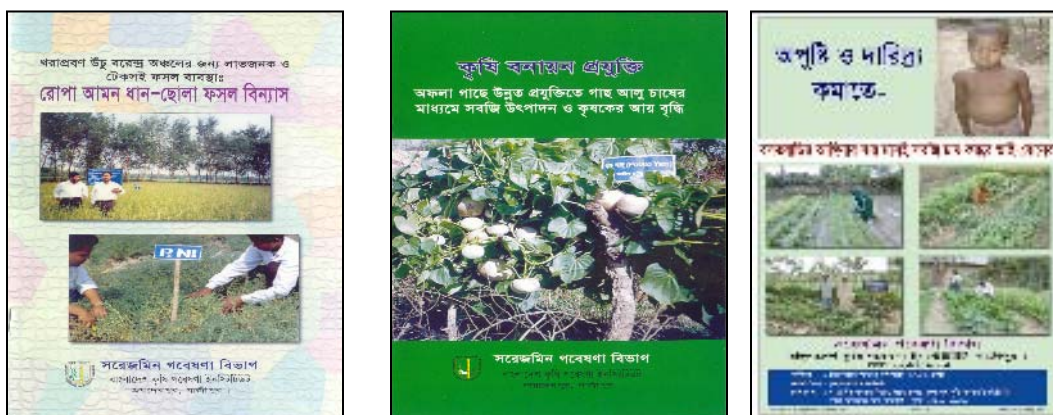
Published technology booklet and poster

Two technology booklets in Bengali language (T.Aman-Chickpea cropping pattern and Dioscorea i. e. potato yam cultivation on non-fruit trees) were published and distributed among the farmers /extension/NGO personnel of the project area. A colored and picture dominated poster on malnutrition, poverty reduction and homestead vegetable cultivation was published and distributed among the stakeholders as per plan. Thus planned option menus preparation, publication and distribution programs were executed fully.