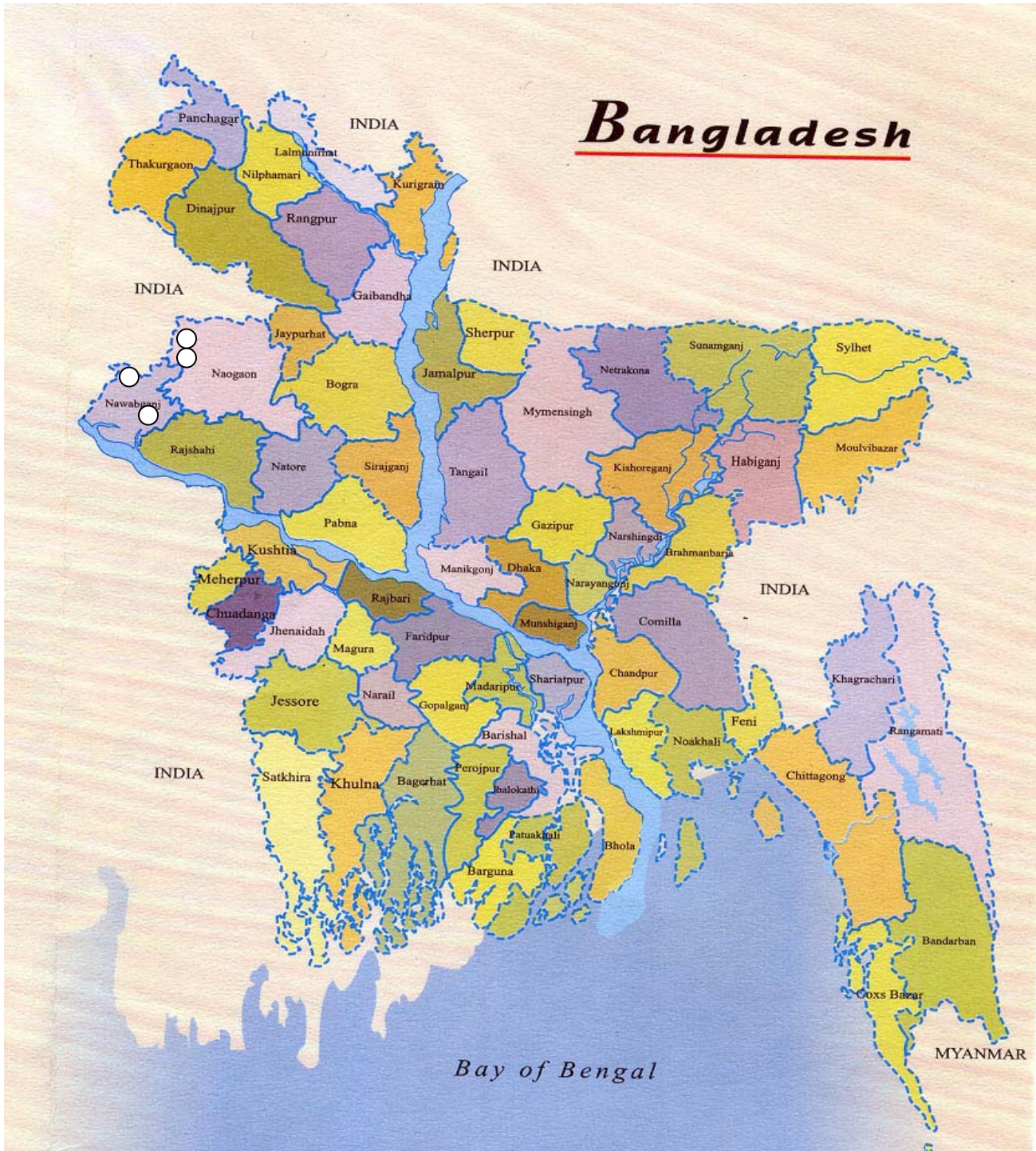
○ Working locations of each two Upzilas of C.Nawabganj and Naogaon Districts under High Barind Tract (not as per scale)